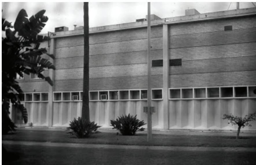
Figure 3 Citesa factory before demolition

Ca. 2009 (Del Pino & Santana, 2009-09-13).