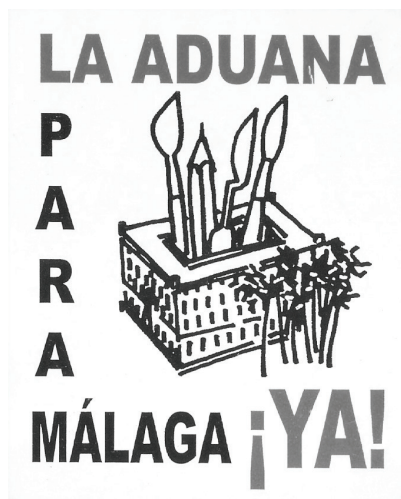
Figure 1 Logo and slogan of the demonstrations in favor of la Aduana