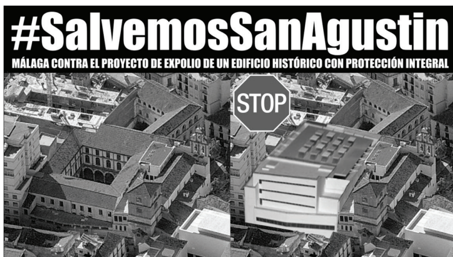
Image used on Change.org with the hashtag #SalvemosSanAgustin (Let's save San Agustin) (Edifeicios, 2018)

Both on the issue of the Hoyo de Esparteros and the Convent of San Agustín , the use of social networks led to the creation of various tags or hashtags. First of all, #SalvemosLaMundial, which was later replaced by #RIPLaMundial and #RecuerdaLaMundial; even today these are used in relation to situations of danger for the Malaga heritage; and secondly #SalvemosSanAgustin.