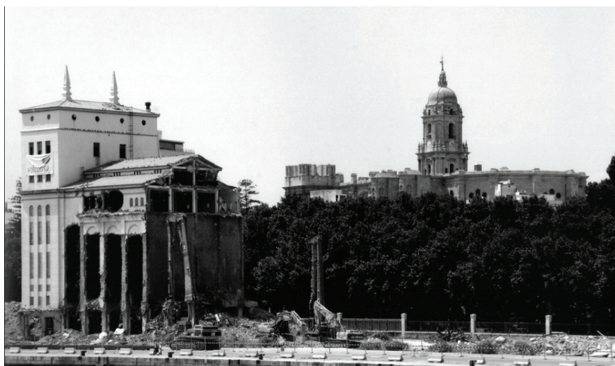
Figure 2 Demolition of the port silo. 2006-05-24