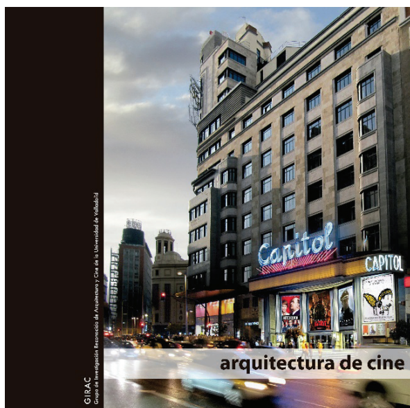
Figure 1 Book cover