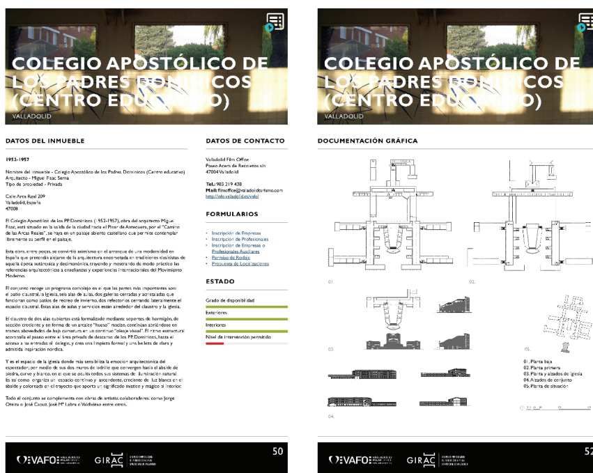
Figure 6 Example of file. “Architecture and cinema for Valladolid”. Valladolid: Valladolid City Council

The contribution of documentation follows a common criterion in Architecture and Cinema for Valladolid: it consists of concise and clear planimetric information, apostilled, to which is added the historical report of the registry and a specific selected bibliography (Figure 6). The section on photographs of spaces is oriented towards greater utility for cinematographic interests, with images and videos from positions that can identify them as places of cinematographic appeal at all scales. As a teaching building, images have been provided from the classrooms, corridors, covered and open recesses, laboratory rooms. As a religious institution, the church takes the most representative spatial role; as a residence in the cloister areas and refectory. The cinema-theater space is offered both in its interior views such