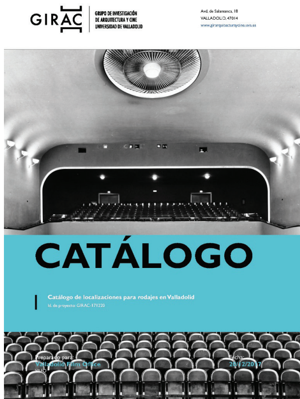
Figure 5 GIRAC, 2018. Catalog “Architecture and Cinema for Valladolid”. Valladolid: Valladolid City Council

the relationships between cartography and cinema (Bruno, 2012) opening avenues of study to the relationships between cinematographic tour and architectural tour, which link, among other references, with the psychogeographic maps of Debord and the situationists.