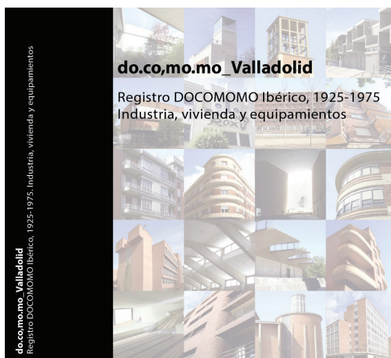
Figure 4 Book cover