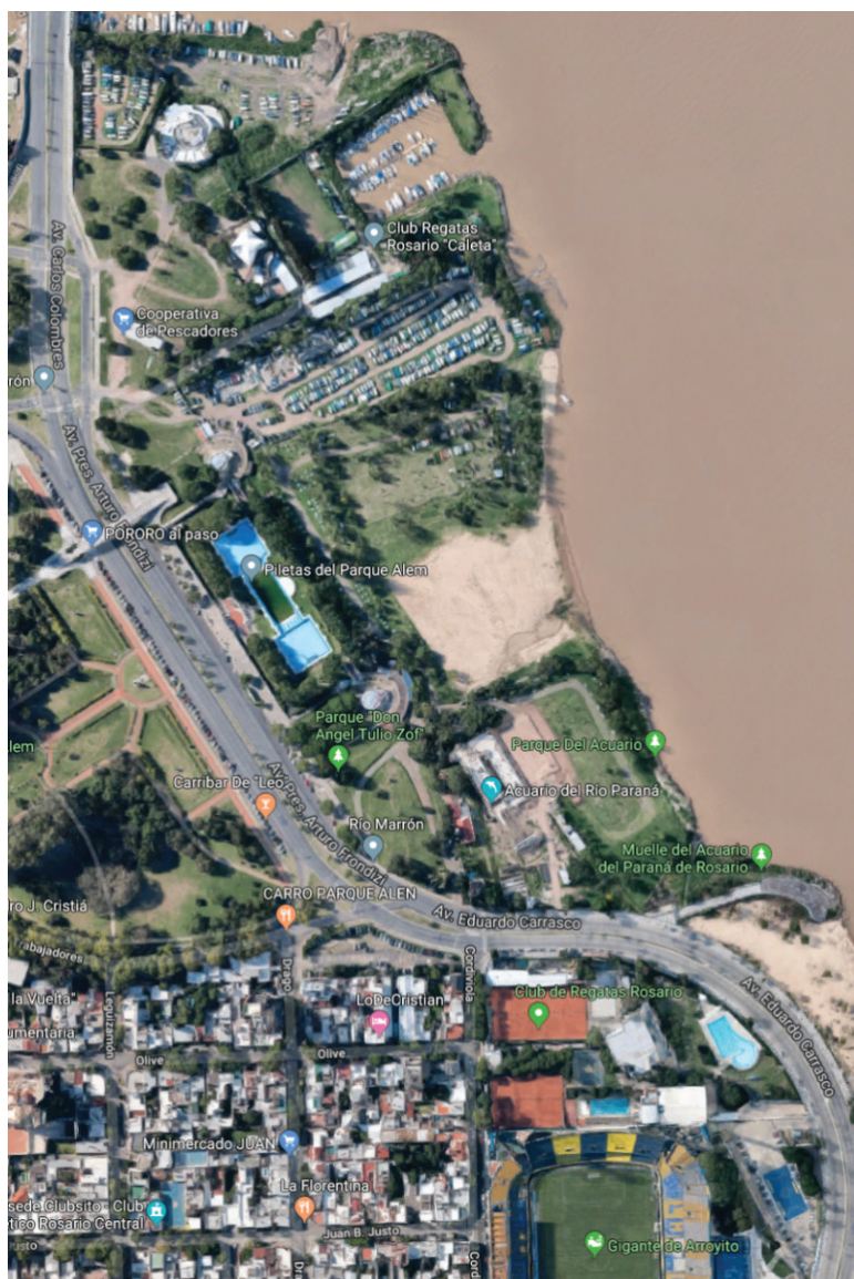
Image 1 North zone of Rosario where the Paraná Aquarium was built