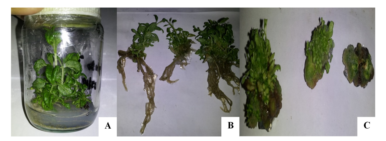
Figure 2. A) Multiplication of vitroplants (MS) in a culture medium without any addition of hormones. B) Root length evaluation. C) Callus formation at the base of plants in a culture medium (MS) with the addition of BAP (0, 1 g l^{-1}) .

Jiménez et al. (2016) in their study with Diant hus caryophyllus , in assessing the effect of the concentration of inorganic salts of the culture medium in relation to the length of the plant did not observe differences between treatments, except with the witness, thus maybe it had the nutrients needed for its growth. However, a reduction in the growth was seen with the decrease in the concentration of mineral salts, being lower in the treatment where 25% was used. These results show that the decrease of the mineral content in the culture media favored the growth retardation, due to alterations occurring in the cellular metabolism.