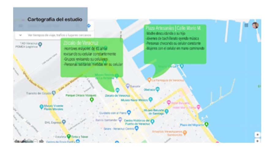
Figure 5: Graphical resource in an observation protocol

As a pedagogical and disciplinary resource, research broadens the horizons from which to understand and size the educational phenomenon. This paper has reflected on this, but an experience has also been shared where students decided, agreed and proposed how they wanted to approach two qualitative cutting research techniques. The execution of one and the other was an interesting experience because of the phenomena or problems addressed, as well as the quality of some evidence that was presented through videos or podcast.