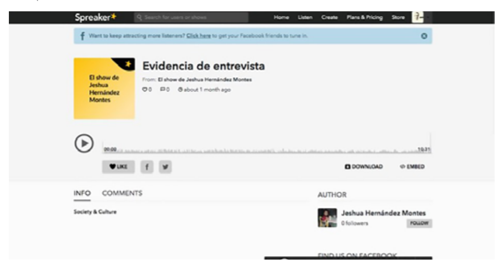
Figure 3. The podcast: Evidence of fieldwork

For the interview, the students proposed to present them on video or podcast , based on the use of software and an application that did not require a sophisticated technical mastery