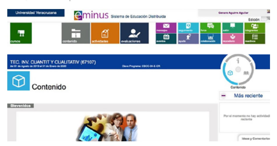
Figure 1. EMINUS, educational platform of Universidad Veracruzana

The basic premise was the opportunity to link the classroom to physical and virtual environments because of the type of activities proposed, the suggested educational resources and the teaching material to be used. Recognizing that not all students often work in "pairs", criteria were established and rubrics were designed to weight each product. In the context of the instructions, EMINUS was established as the site to present the evidence of learning, while, on the blog a text was published with instructions to guide the activities; so each student had to read it to know what to deliver individually and what as a team.