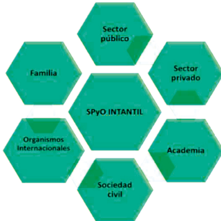
Figure 1. Social and co-responsible agents for the OWandO problem

On the other hand, the Mexican Institute for Competitiveness (IMCO, 2017), indicates the need to have a comprehensive view of the problem and the actions to be undertaken, which requires multisectoral and multi-government support. Figure 1 shows the co-responsible social actors for the reduction and prevention of OWandO.