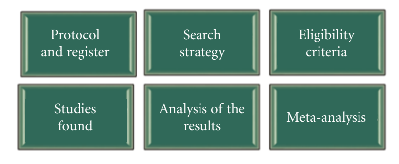
Figure 1. Synthesis of the steps to be taken in the systematic review with meta-analysis (PRISMA Declaration)

to answer these questions (Rubio-Aparicio, Sánchez-Meca, Marín & López, 2018; Okoli & Schabram, 2010). For its elaboration, the quality standards of the PRISMA declaration for systematic reviews were taken into account (Urrutia & Bonfill, 2010), as well as impact works that follow this type of methodology (Hinojo, Aznar, Cáceres, Trujillo, & Romero, 2019).