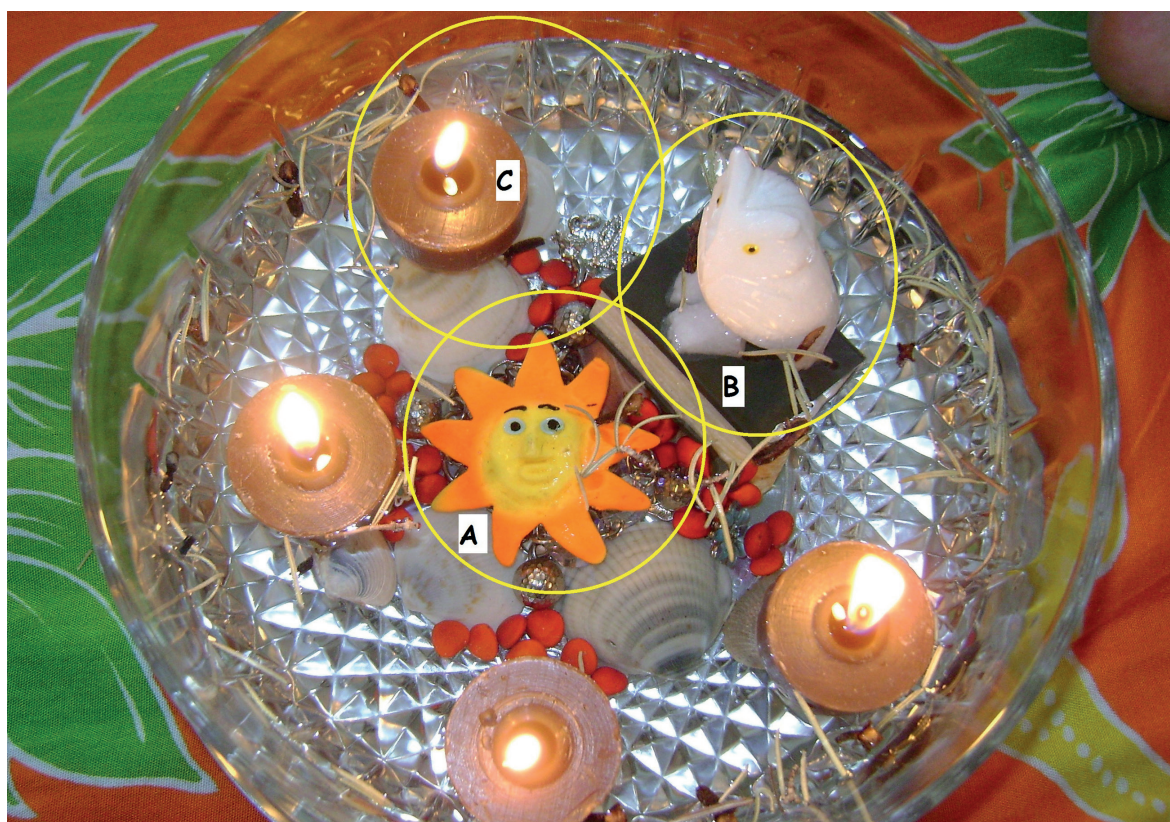
Figure 3: Scenario entitled “The flame of education”. A): the energy, which symbolizes the Heteroformation; B) the owl, which symbolizes Self-formation; C) the candles, which symbolize Ecoformation

to the author, fire causes personal intuitions and scientific experiences to be confused by being an immediate object with phenomenological value when acting in an impure objective zone.