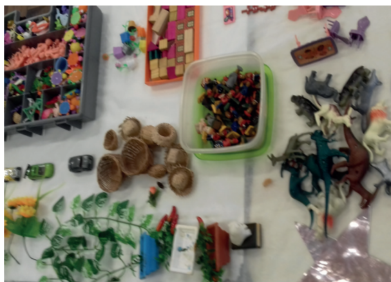
a) Offered miniatures