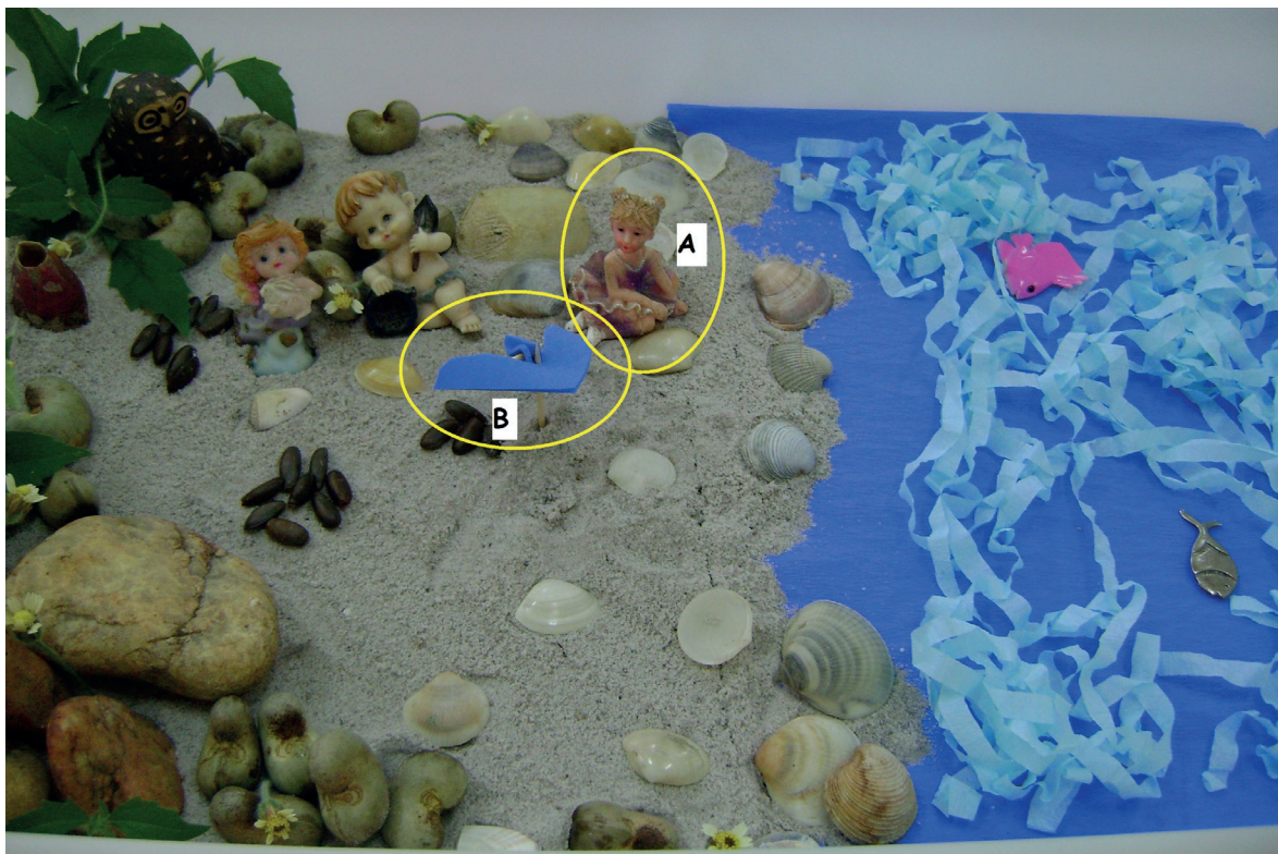
Figure 5: Scenario entitled ‘New life, new airs’. In (A), symbolizing the opening for new investigations. In (B), symbolization of encounter with the hummingbird

Grande do Norte, the city of Natal. In this new ‘garden’, the observed environment is a little different in several aspects: for its biodiversity, with its dunes; for cultural expression, with its beliefs and values; or even by the way people relate to themselves and their environment. “To root out demands violence, provocations, shouting,” as Bachelard states (2003, p.229). So, in accordance with Pineau (2008a, p.55), when he tells us that “it takes a lot of time and energy to find another place to re-establish root,” we were aware that it would be necessary to start all over again in a ‘garden’ that we did not know, that was strange to us.